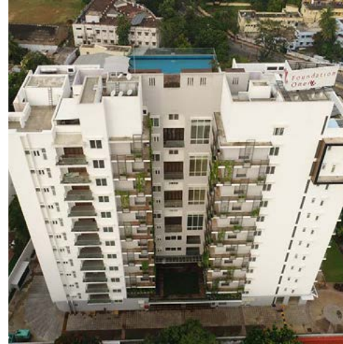
SHREE APARTMENTS, COIMBATORE