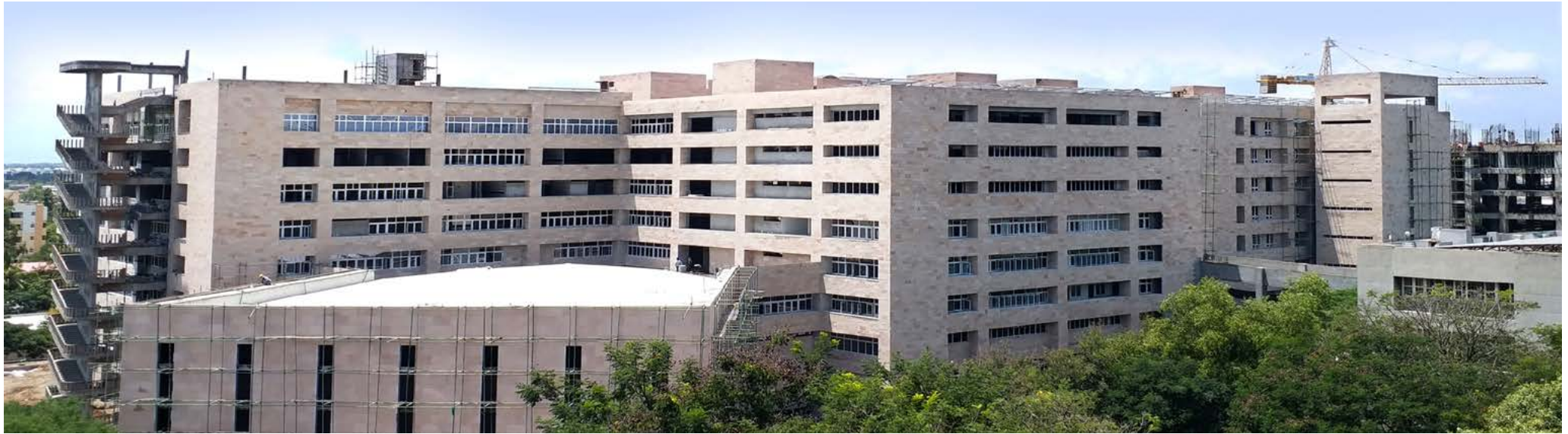
PSG INSTITUTE OF MEDICAL SCIENCES & RESEARCH, COIMBATORE