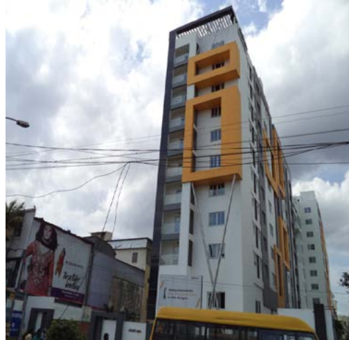
AKSHAYA "36 CARAT" APARTMENTS, CHENNAI