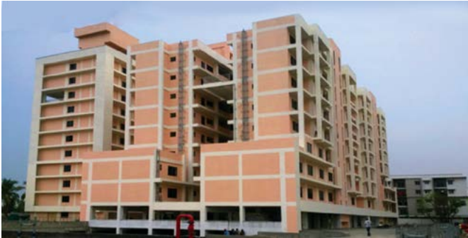
HOSTEL & HOUSING BLOCKS, ARAVIND EYE HOSPITAL, CHENNAI