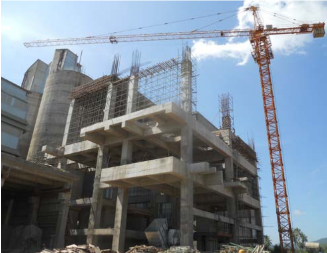
MADRAS CEMENTS LIMITED, VALAPADI