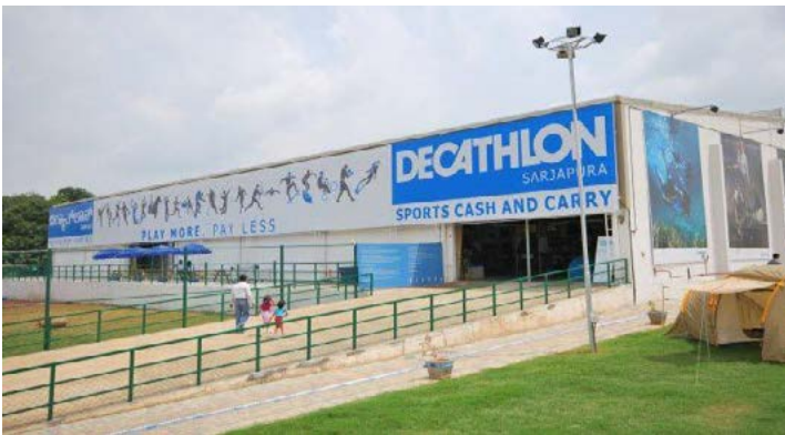
DECATHLON SPORTS, BANGALORE