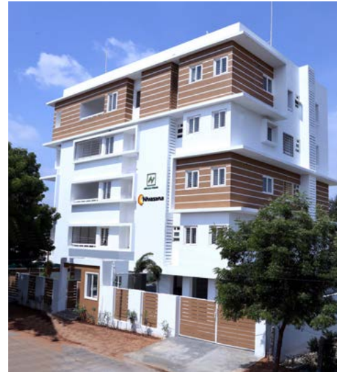
NIVASANA APARTMENTS, COIMBATORE