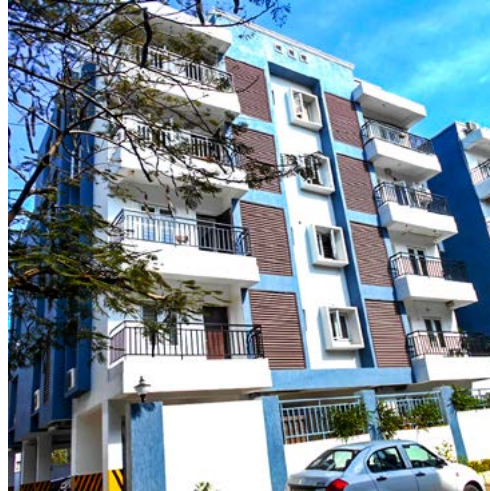
SOMA APRTMENTS, CHENNAI