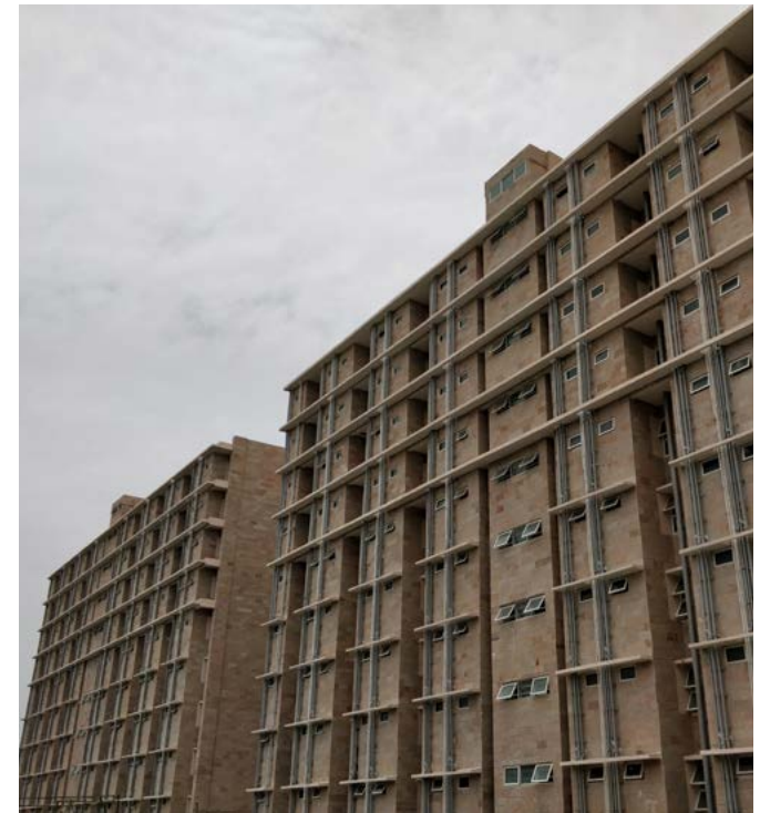
HOSTEL BLOCKS, PSG INSTITUTE OF MEDICAL SCIENCES AND RESEARCH, COIMBATORE