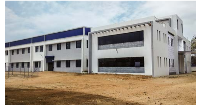
COSMIK INDUSTRIES, COIMBATORE