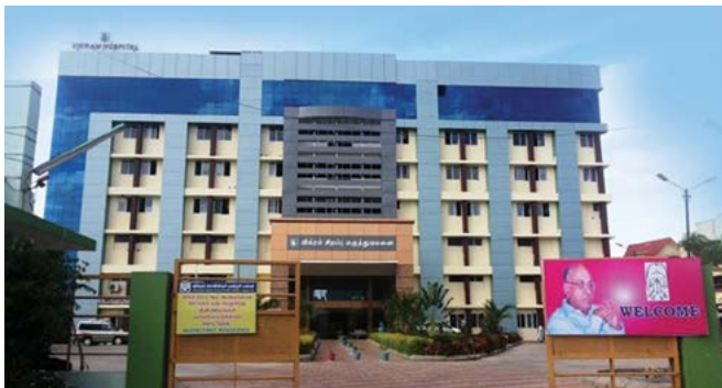
VIKRAM HOSPITAL, MADURAI