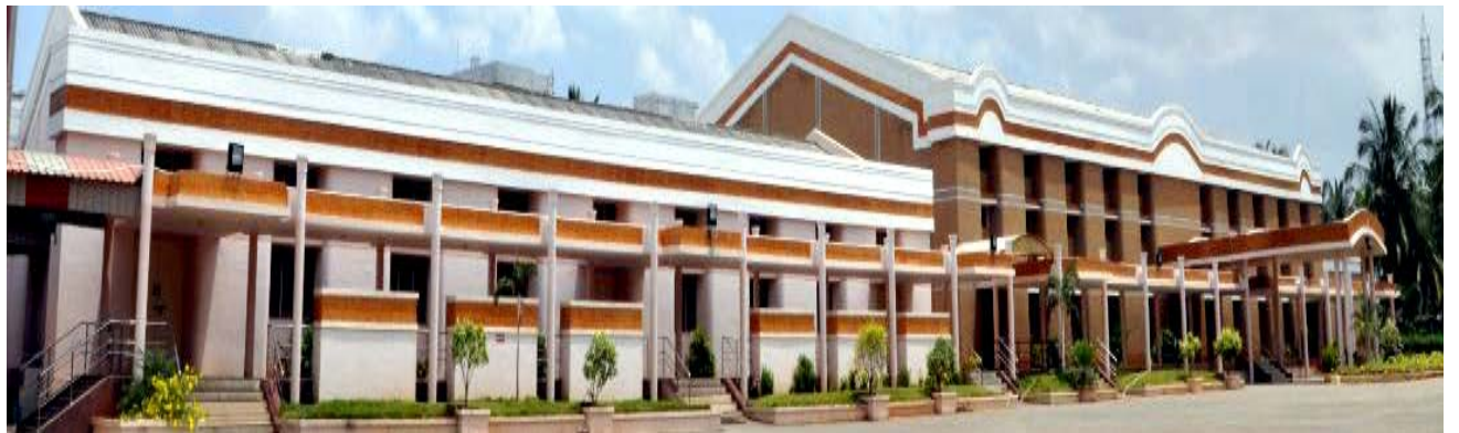
SNR AUDITORIUM, COIMBATORE