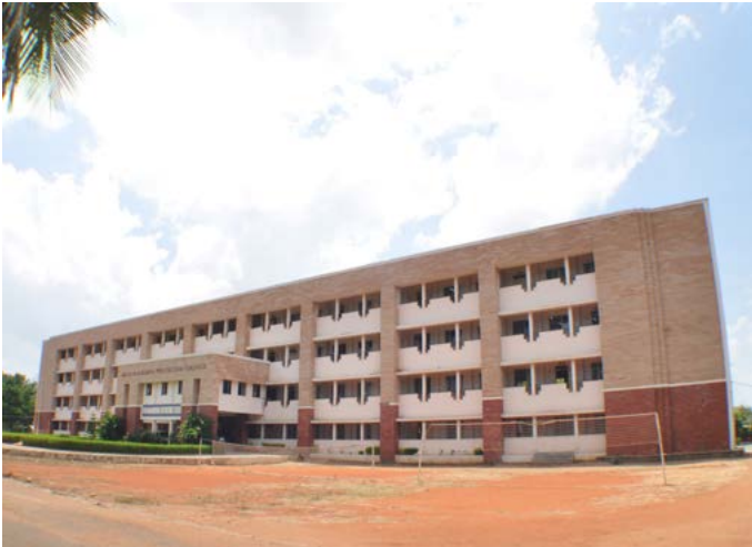
SRI RAMAKRISHNA POLYTECHNIC, COIMBATORE