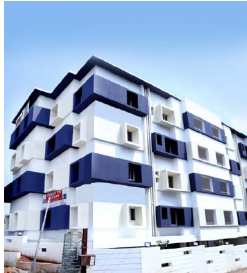
MEENAKSHI VISHRANTH APARTMENTS, COIMBATORE