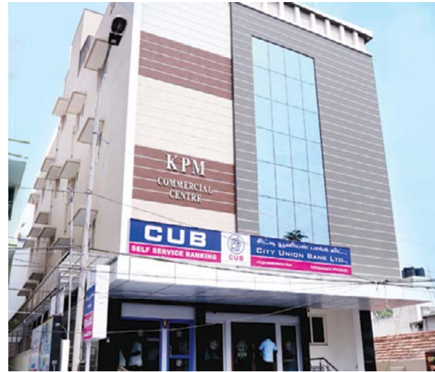
KPM TOWERS, COIMBATORE