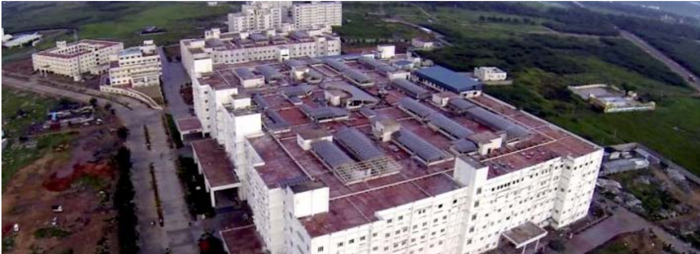
VELAMMAL MEDICAL COLLEGE AND HOSPITALS, MADURAI