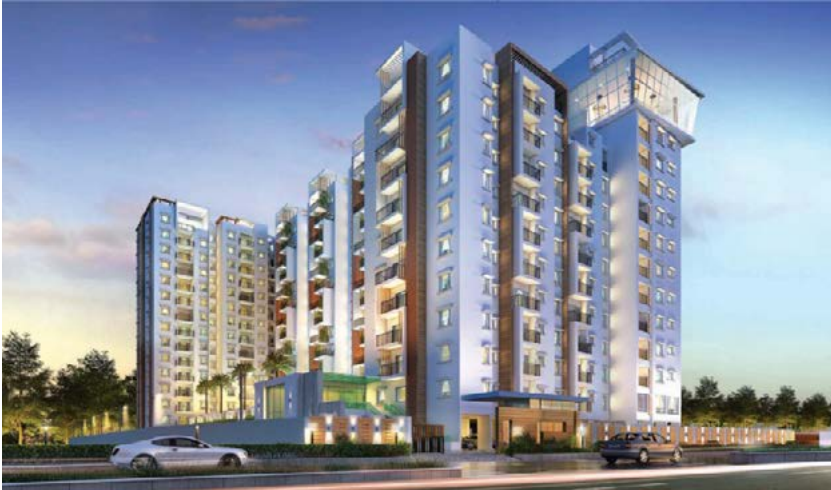
AKSHAYA "TANGO" APARTMENTS, CHENNAI