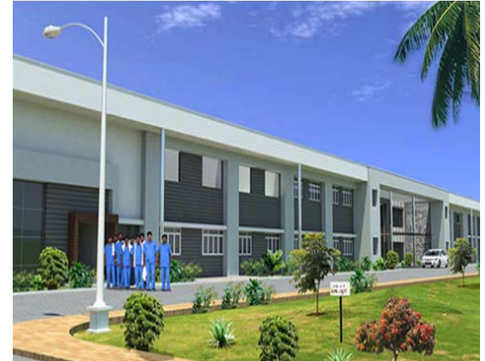
KPR MILLS, COIMBATORE