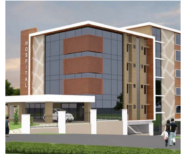
DR. MANOHARAN HOSPITAL, COIMBATORE