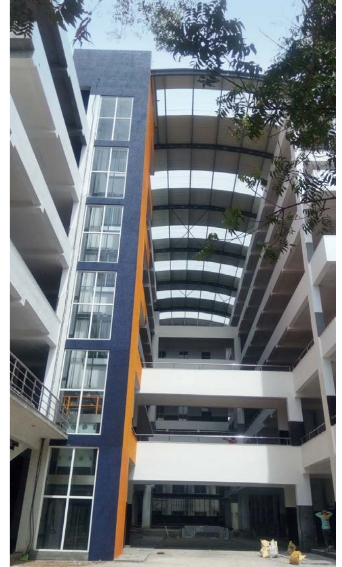
MBA- MCA BLOCKS, HINDUSTAN COLLEGE OF ARTS AND SCIENCE, COIMBATORE