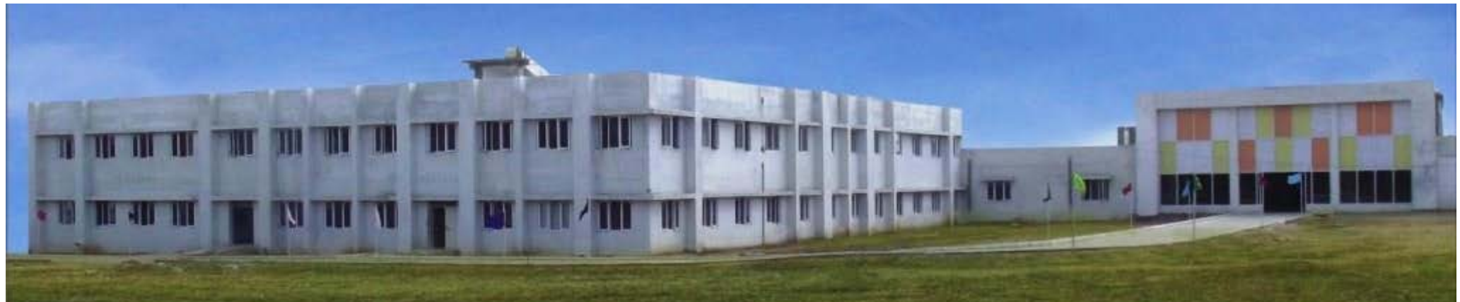
ARJUN COLLEGE OF TECHNOLOGY, COIMBATORE