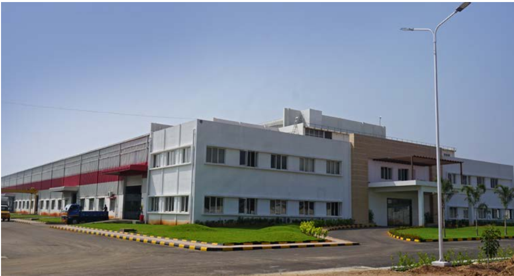
MARKS ENGINEERING WORKS, COIMBATORE