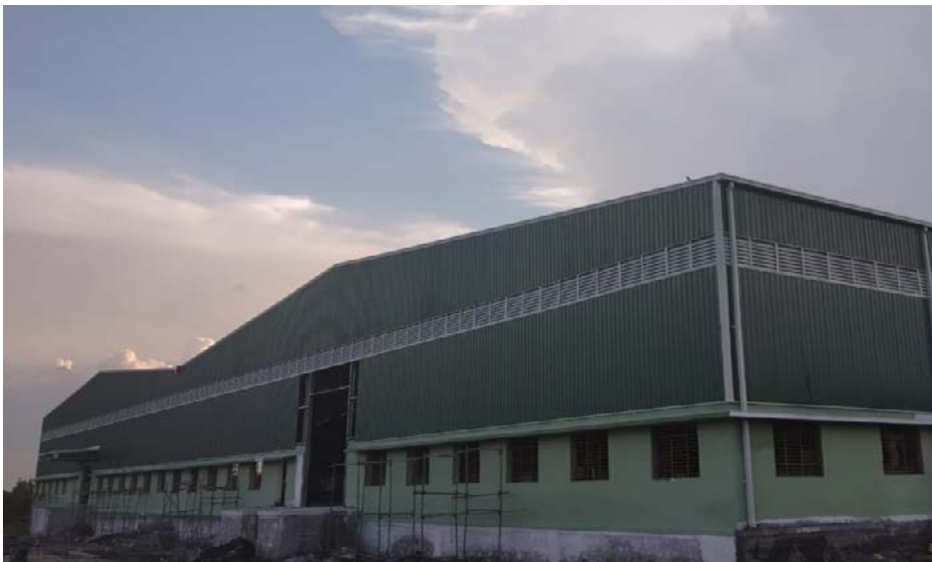
L.G. BALAKRISHNAN & BROS LTD, COIMBATORE