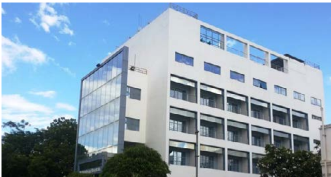
VADAMALAYAN HOSPITAL, MADURAI