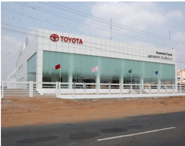
ANAMALAI TOYOTA, TIRUNELVELI