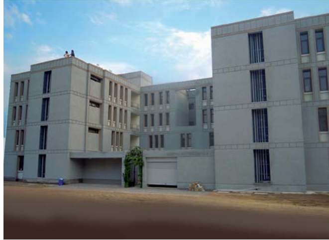
GIRLS AND BOYS HOSTELS, KUMARAGURU COLLEGE OF TECHNOLOGY, COIMBATORE