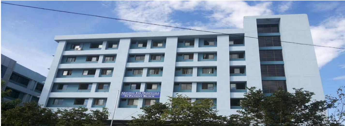
IN-PATIENT BLOCK, ARAVIND EYE HOSPITAL, MADURAI