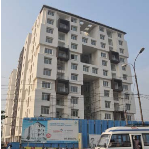
SOLITAIRE APARTMENTS, CHENNAI