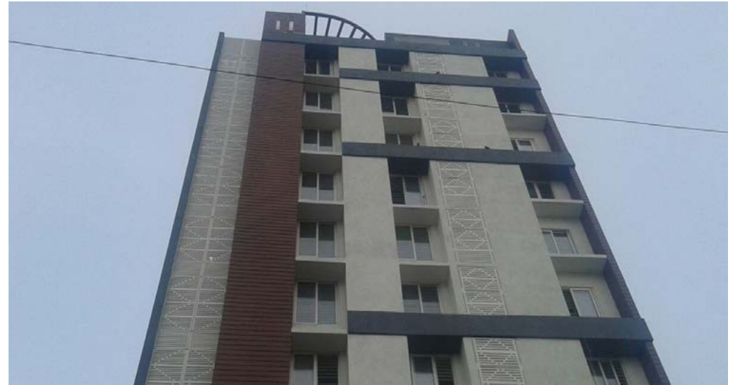
ISHAN APARTMENTS, CHENNAI