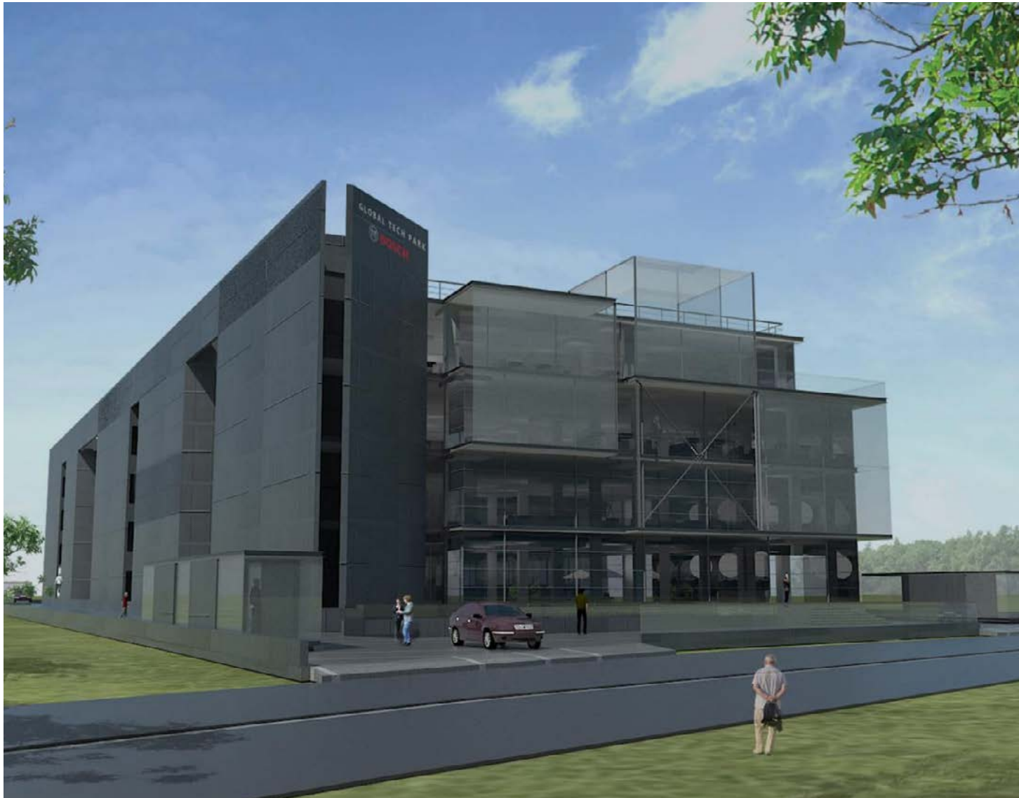
GLOBAL TECH PARK, COIMBATORE