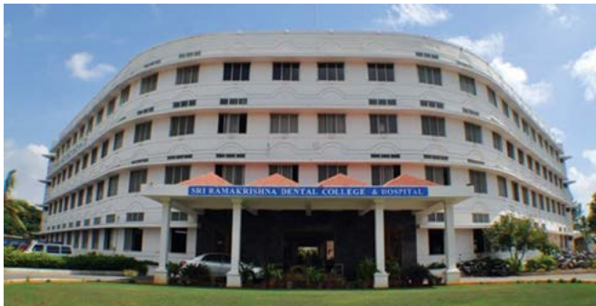
SRI RAMAKRISHNA DENTAL COLLEGE, COIMBATORE