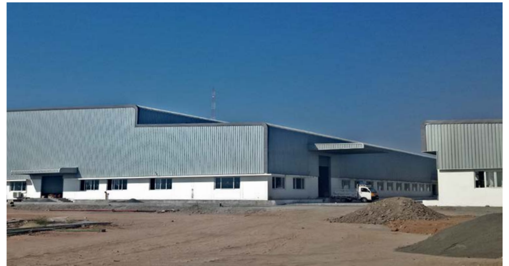
PERFECT ENGINEERS, COIMBATORE