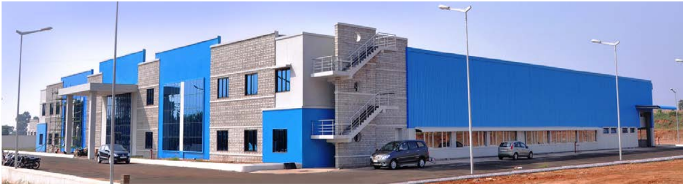
AKG INDIA PVT LTD, COIMBATORE