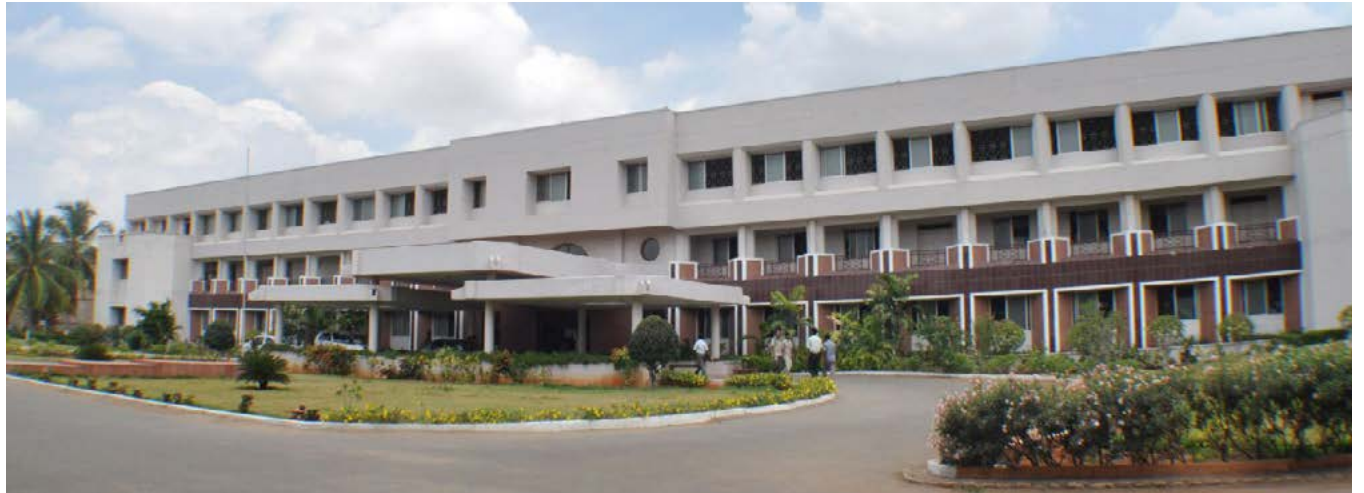
SRI RAMAKRISHNA ENGINEERING COLLEGE, COIMBATORE