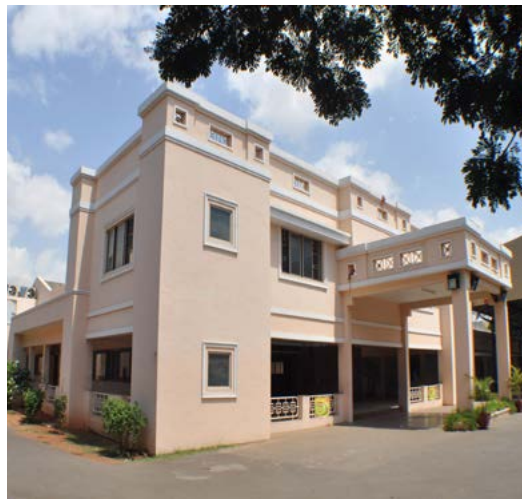
SNR HALL, COIMBATORE