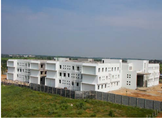
ADITHYA MATRICULATION SCHOOL, KURUMBAPALAYAM COIMBATORE