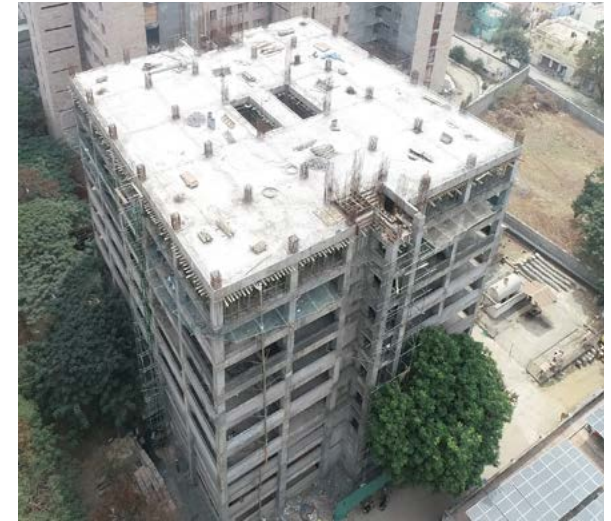
PSG INSTITUTE OF MEDICAL SCIENCES AND RESEARCH FACULTY BUILDING, COIMBATORE