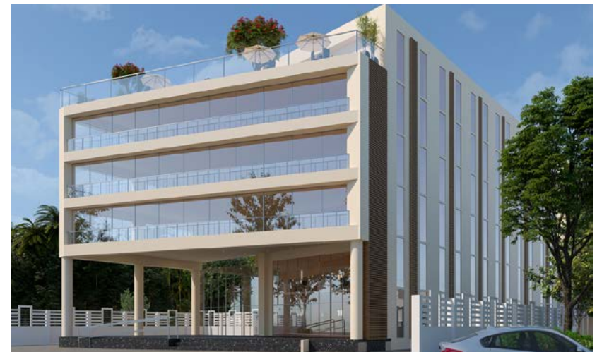
ECHO POINT PLAZA, COIMBATORE