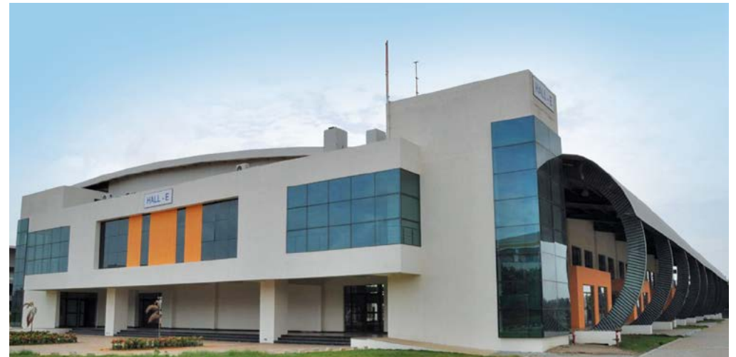
CODISSIA HALL-E, COIMBATORE