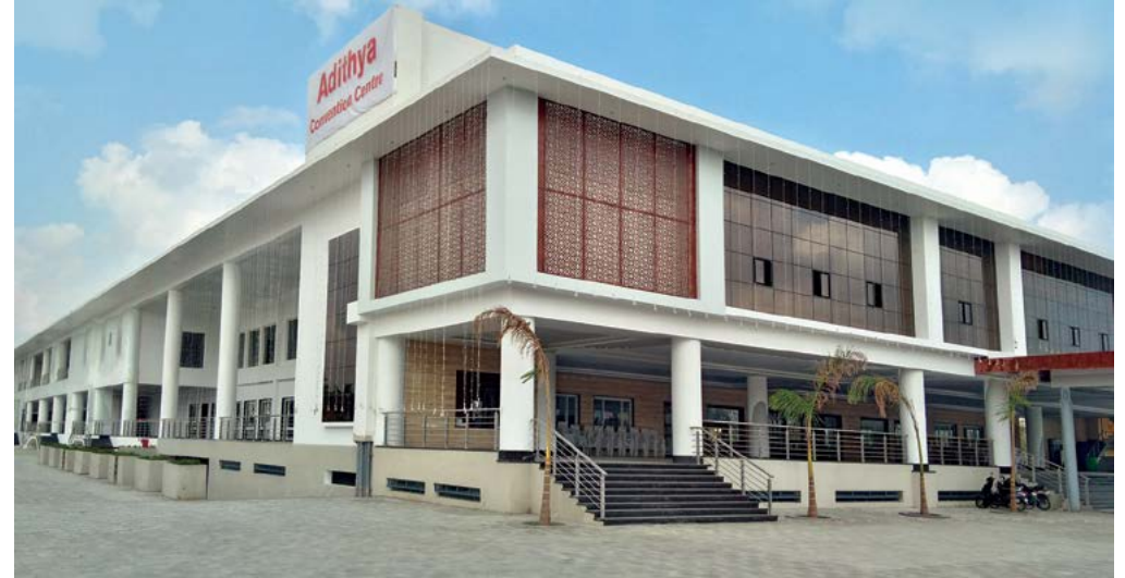
ADITHYA CONVENTION CENTER, COIMBATORE