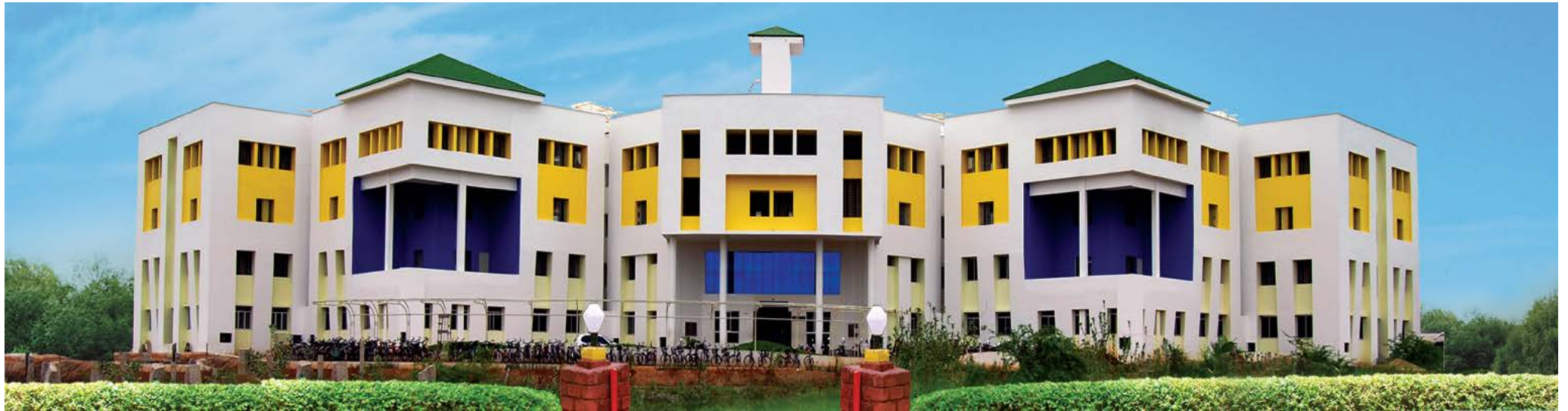
MAHATMA MONTESSORI SCHOOL, MADURAI