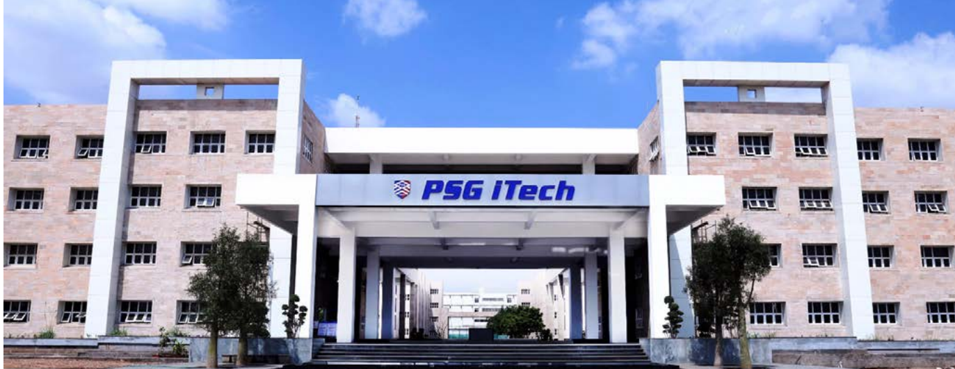
PSG INSTITUTE OF TECHNOLOGY & APPLIED RESEARCH, COIMBATORE