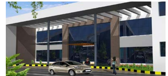
KPR MILLS, COIMBATORE