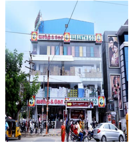
VASANTH & CO, COIMBATORE