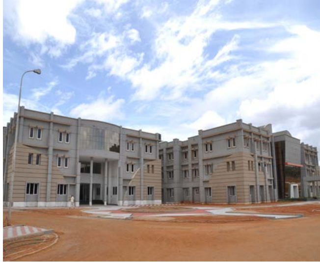
ADITHYA INSTITUTE OF TECHNOLOGY, COIMBATORE