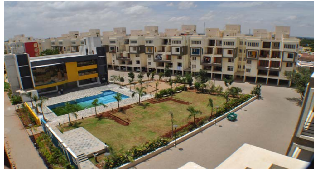
TVH "EKANTA" APARTMENTS, COIMBATORE