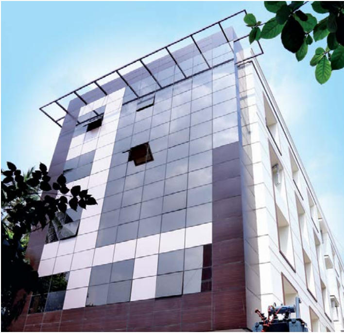
ARPUTHAM PILLAI COMPLEX, COIMBATORE