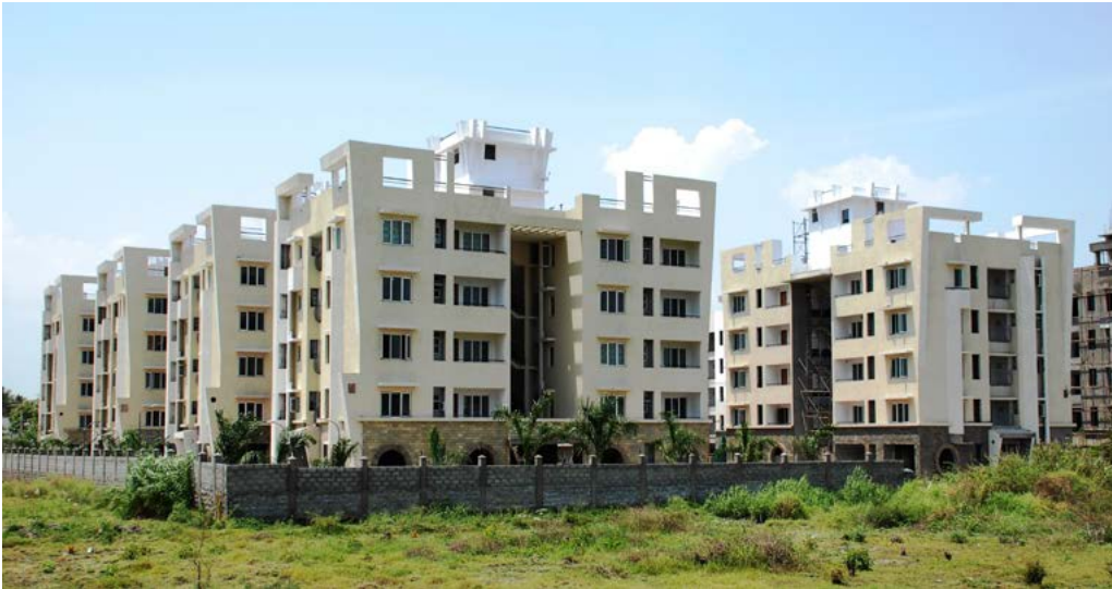
PARSAN "ANTARA" APARTMENTS, COIMBATORE