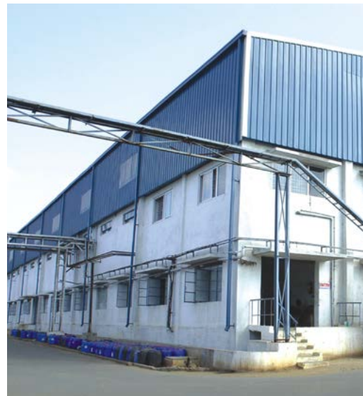
KG DENIM, COIMBATORE