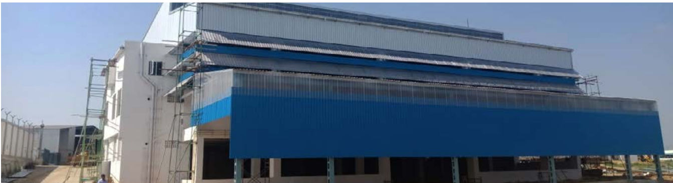
CRI HYPRESS, COIMBATORE