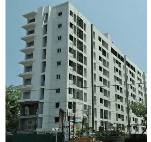
SINDHOOR PUSHPAVANAM APARTMENTS, CHENNAI