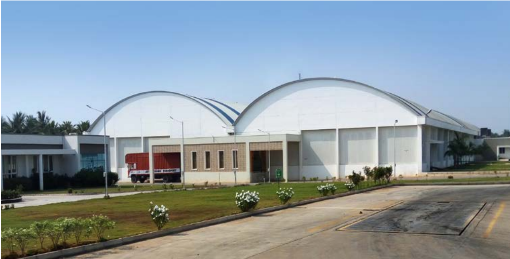
EXOTIC FRUITS PVT LTD, KRISHNAGIRI