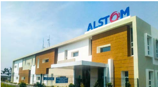
BULL MACHINES PVT.LTD, COIMBATORE