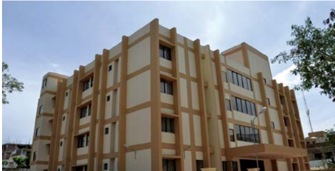
TRAINEES HOSTEL, ARAVIND EYE HOSPITAL, MADURAI