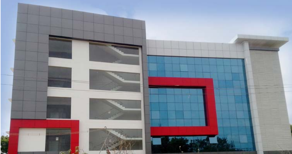
BUSHIDO INFOTECH, COIMBATORE