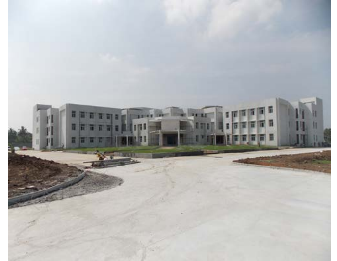
ADITYA CBSE SCHOOL, IDIKARAI