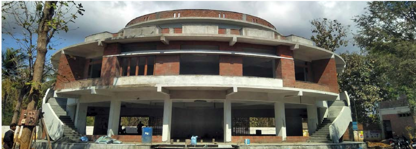
THE SCHOOL KFI, CHENNAI