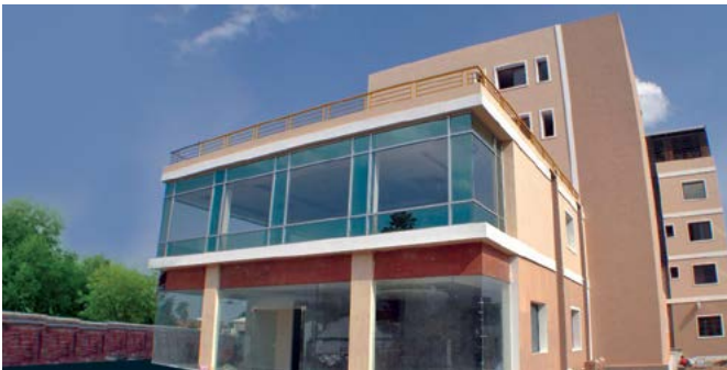
ORTHO ONE HOSPITAL, COIMBATORE