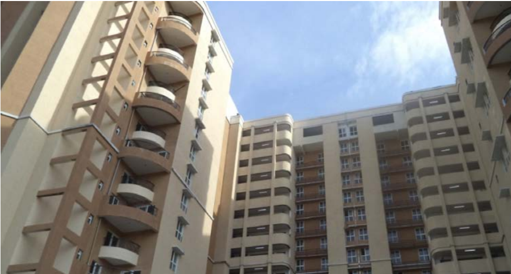
ALAKKA PALAZZO APARTMENTS, CHENNAI