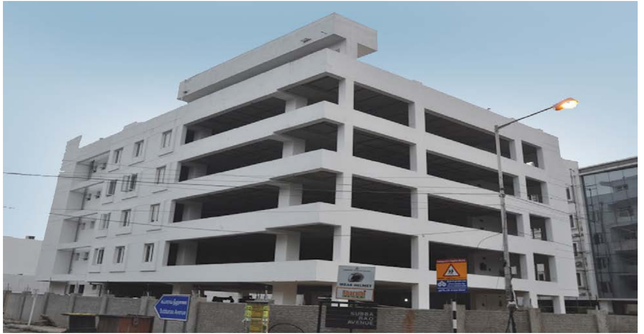
PRASANNA COMPLEX, CHENNAI