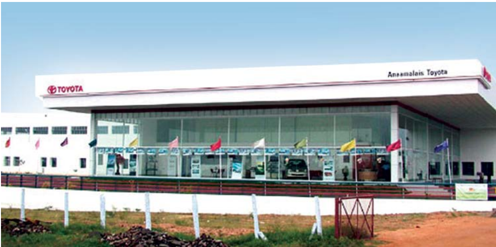
ANAMALIS TOYOTA, MADURAI