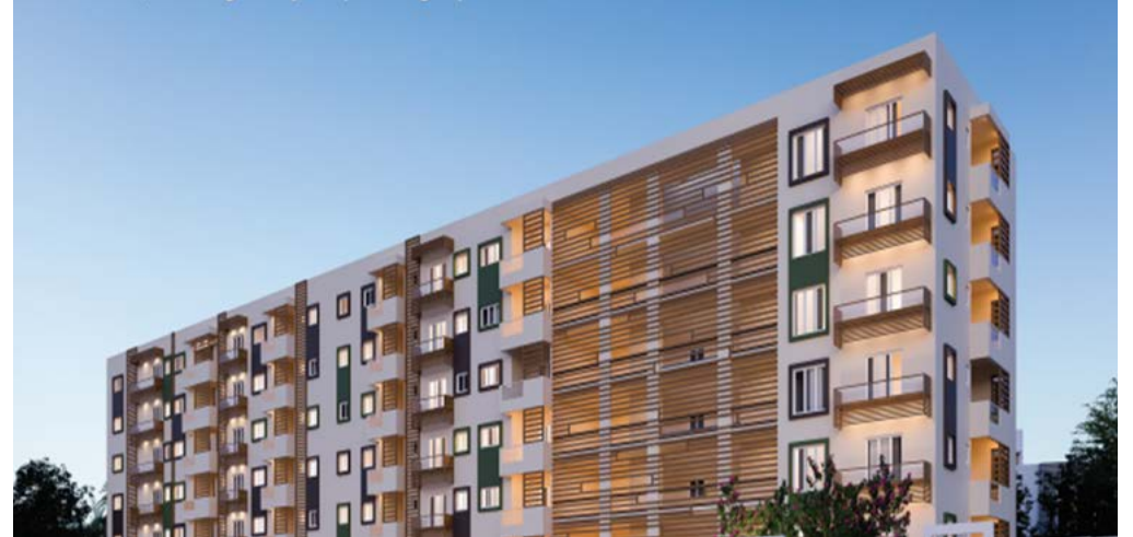
ECHO POINT-AVAAS APARTMENTS, COIMBATORE