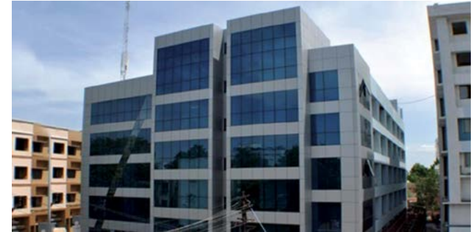
DR.G.VENKATASAMY RESEARCH INSTITUTE, MADURAI