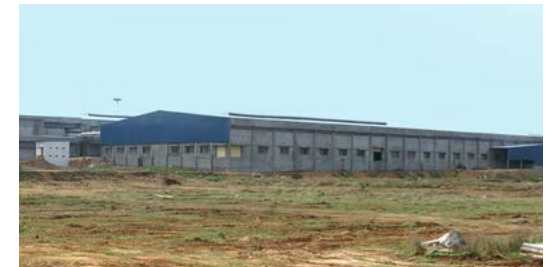
KG FABRIKS, PERUNDURAI