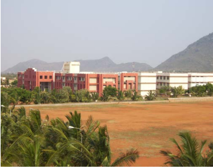
SRI RAMAKRISHNA INSTITUTE OF TECHNOLOGY, COIMBATORE