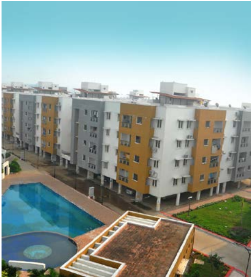
ADOBE VALLEY APARTMENTS, CHENNAI