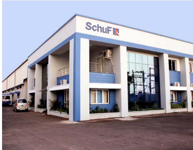
SCHUF SPECIALITY VALVES INDIA PVT. LTD, COIMBATORE