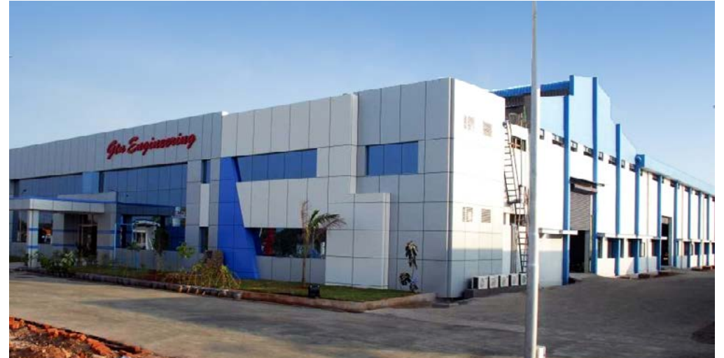
GTN ENGINEERING (INDIA) LIMITED, COIMBATORE