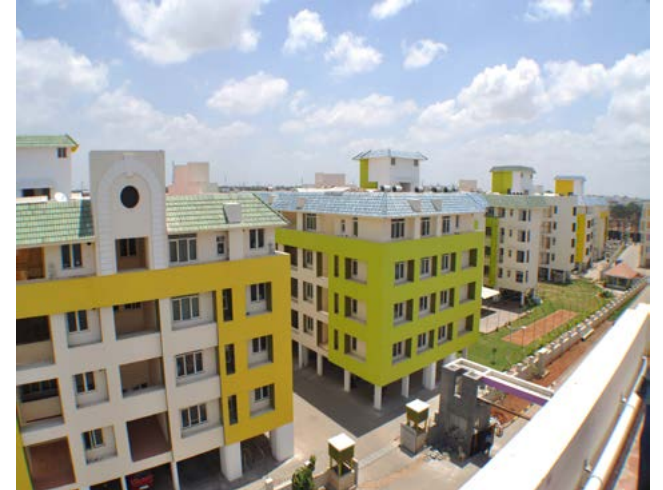
PARSN "KEYSTONE" APARTMENTS, COIMBATORE