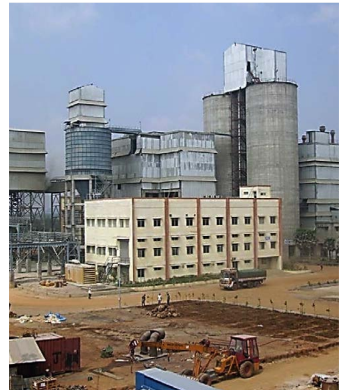
MADRAS CEMENTS LIMITED, CHENGELPET