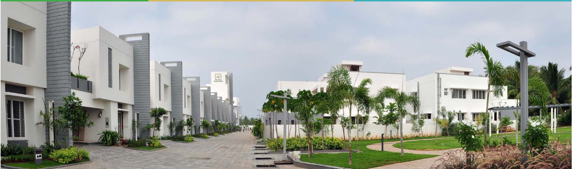
VIVEKA ENCLAVE, COIMBATORE

Under Development : No of Units – 1,841 | Area -19,99,500 Sft