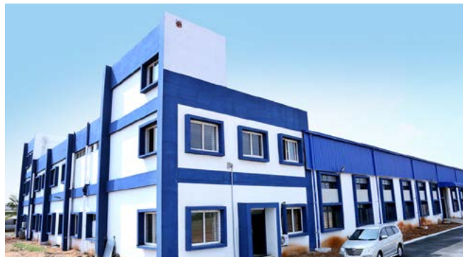
SAKTHI GEAR PRODUCTS, COIMBATORE