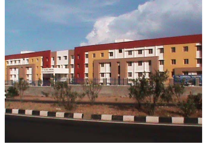
VELLAMMAL MATRICULATION SCHOOL & VELLAMMAL VIDYALAYA - KARUR