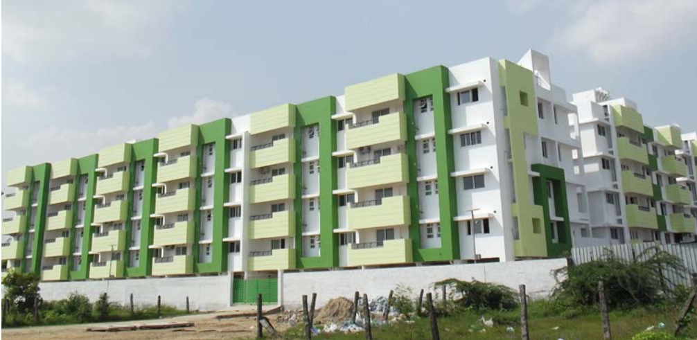
MEADOWS APARTMENTS, COIMBATORE